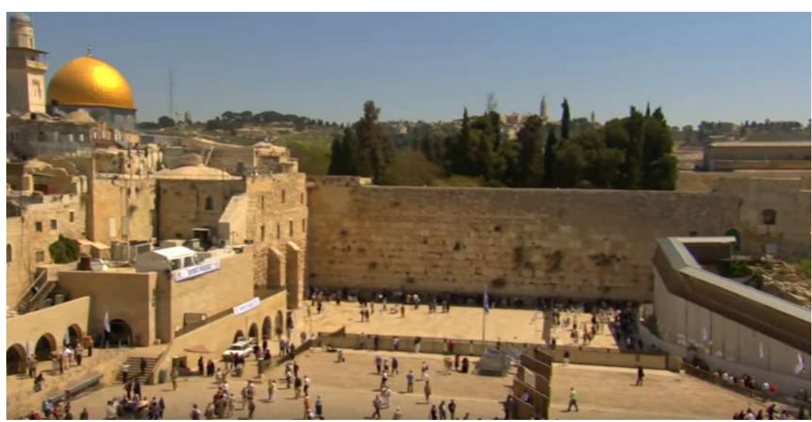
The Western Wall Plaza