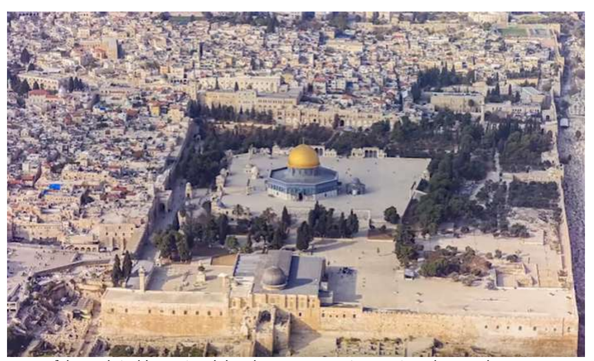
Dome of the Rock (golden top) and the Al-Aosa Mosque (grey top) on the Temple Mount.

28,000 priests ready to serve in the Temple | www.templeinstitute.org