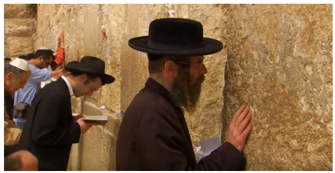
Prayer at the Western Wall

The Western Wall is considered holy due to its connection to the Temple Mount. Because of the status quo policy, the Wall is the holiest place where Jews are permitted to pray at this time.