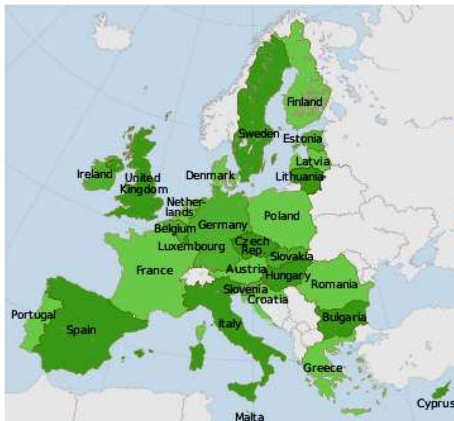
Member states of the European Union (not accounting for Brexit)

As we will see in our later studies, Daniel describes 10 rulers (or leaders of nations) from this region (The former Roman Empire), who receive power “for one hour”—symbolic of a short time—from whom emerges a single ruler (leader) who is also called “the beast” (Daniel 7:19-28; Revelation 17:12-13). “These will make war with the Lamb [the returning Jesus Christ], and the Lamb will overcome them ...” (Revelation 17:14). This coming together of these 10 nations under the leadership of “the beast” leads right into the return of Jesus Christ to earth.