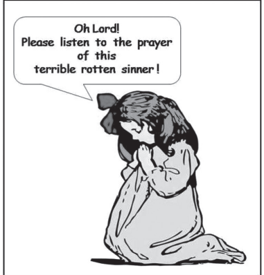
(Hint: Depending on the <u>context</u> both prayers could be right and both prayers could be wrong.)